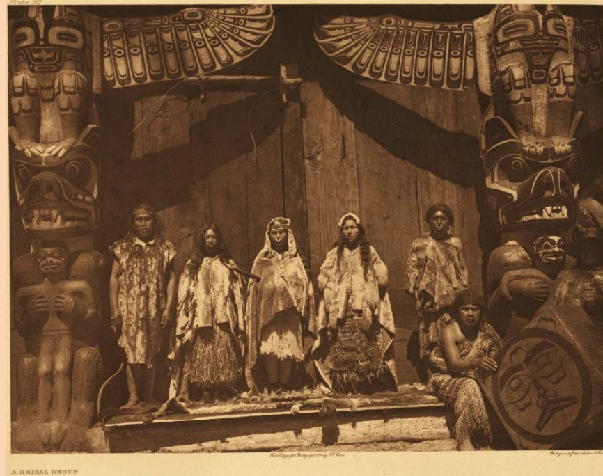
A BRIDAL GROUP