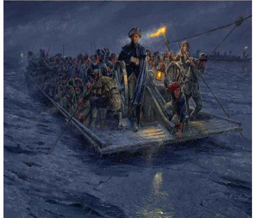
How the boats should have looked