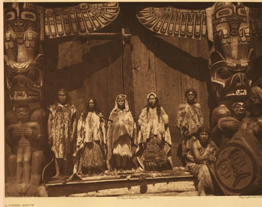
A WEDDING GROUP